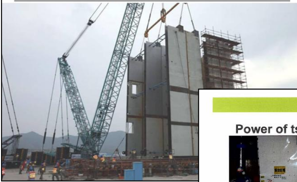
Power of tsunami