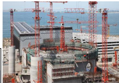
Flamanville 3 – UK EPR Prototype – July 2010