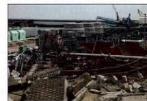
Office for Nuclear Regulation An agency of HSE